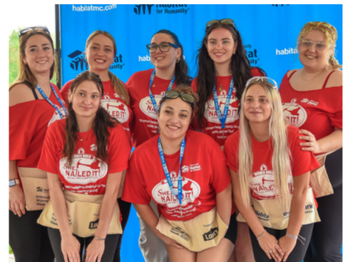
Image from She Nailed It! 2025.

Our Tricky-Tray Basket Raffle will once again be a major highlight of this year’s She Nailed It! event, and tickets are available to purchase online now through the day of the event. Participants can purchase tickets for $5 for 1, $10 for 3, or $20 for 10, and place them toward any of our exciting raffle baskets and prizes. This year’s raffle will feature an incredible variety of items, including stays at local hotels and resorts, golf passes, gift cards to local shops and restaurants, and many other great experiences and prizes generously donated by community partners. Best of all, every ticket purchased directly supports Monroe County Habitat for Humanity’s mission, helping us continue our work building, repairing, and improving homes for families throughout Monroe County.